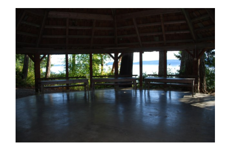
Close to the Lodge and Staff House. There is a latrine just north of the Rotunda.