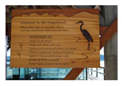
Photo of the boat dock and the touch tanks used during resident camp below.

The restrooms at the Boat House are flush toilets with hot and cold water and showers.