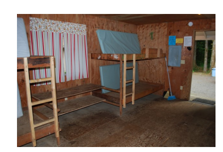
Alder Hill A-Frames

3 A-frame chalets, has eight bunks, set in a half-circle for a community feel. All A-frames are close to each other and centered around the fire-circles. Water, fire circles and picnic tables in unit. Gear locker's with outdoor equipment stored inside each A-frame. Shares the Alder Hill shower house and Alder Hill program shelter with the Alder Hill Cabins. Wood for the fire circles is stored on site in the shed. The Alder Hill Amphitheater is nearby.