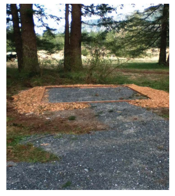
Picnic tables on gravel